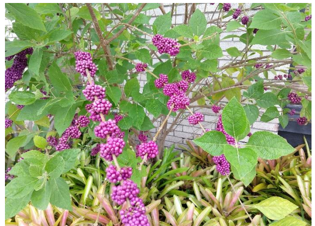
10/23/19 Plant Picture of the Day: Beautyberry (Callicarpa americana)