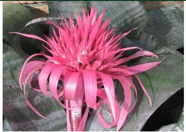
10/15/19 Plant Picture of the Day: Aechmea fasciata

December 15 th Meeting at 1:00 PM: Annual Holiday Party