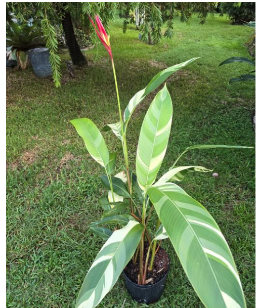
7/31/24 Plant Picture of the Day: Heliconia 'Lady Di' variegated