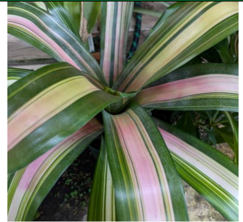
8/16/24 Plant Picture of the Day: xNeomea 'Flashdance' by Greg K.

October 20 th Meeting: Terrie Bert with a Bromeliad Topic