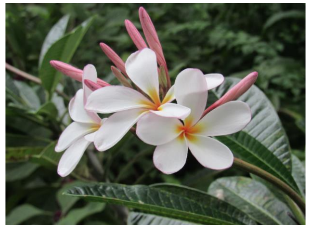
10/14/20 Plant Picture of the Day: Plumeria