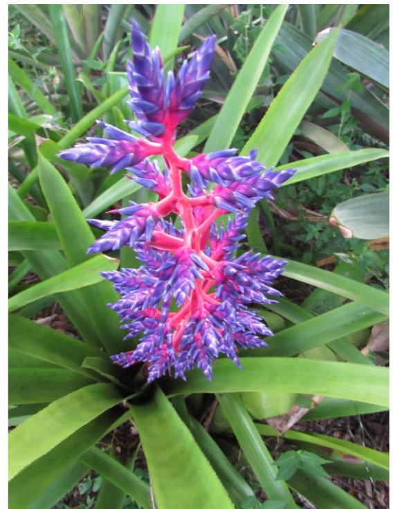
10/11/20 Plant Picture of the Day: Aechmea 'Blue Tango'