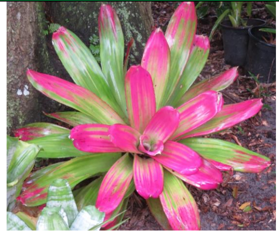
10/20/20 Plant Picture of the Day: Neoregelia 'Passion'

Holiday Party: December 20, 2020 at 1:00 PM