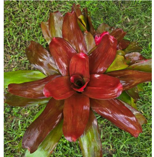
7/25/24 Plant Picture of the Day: Neoregelia 'John Boardman'