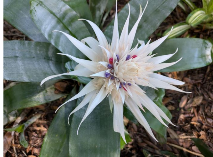
6/30/24 Plant Picture of the Day: Aechmea fasciata 'White Spineless' by Greg K.