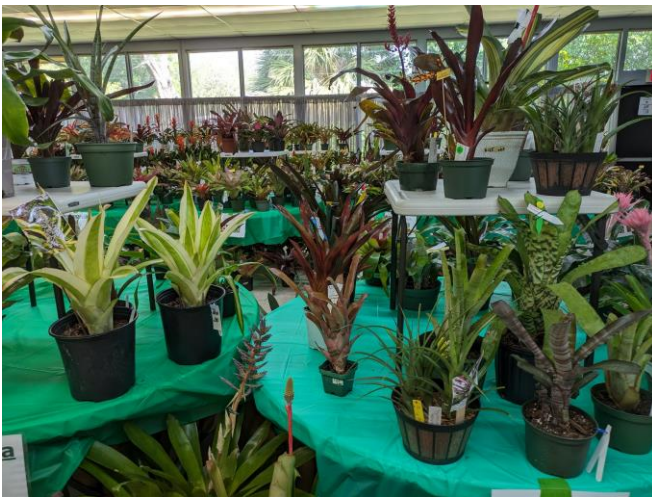
Plants at the 2024 Spring Plant Sale

The SBTPS plant sale features a large selection of Bromeliads, Gingers, Orchids, and many other tropical plants.