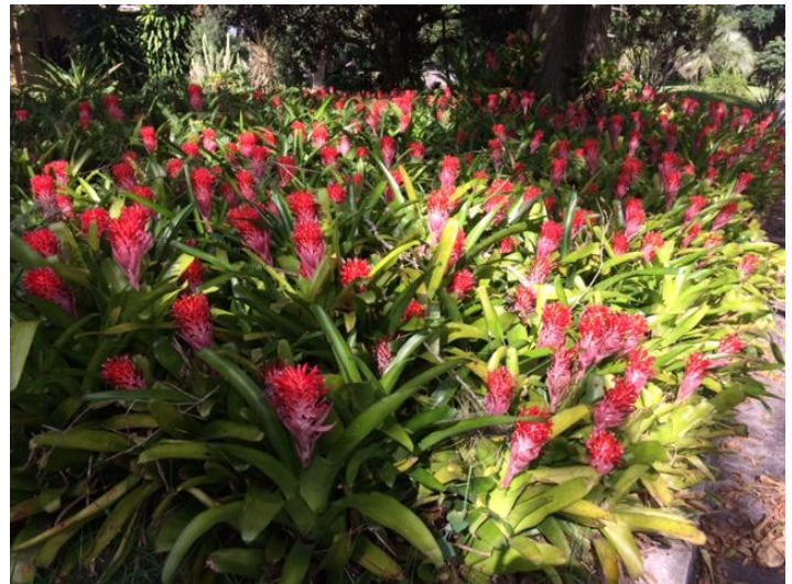
9/6/20 Plant Picture of the Day: Billbergia pyramidalis photo taken by Cathy in Orlando

Refreshments for the September meeting will be provided by the SBTPS.