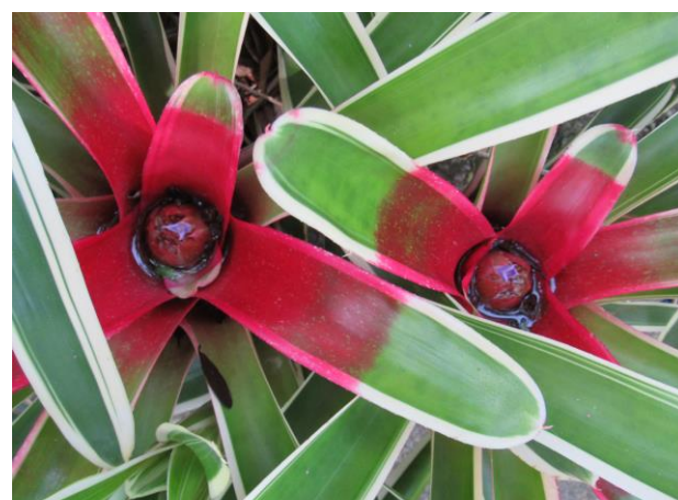
9/9/20 Plant Picture of the Day: Neoregelia 'Sheba'