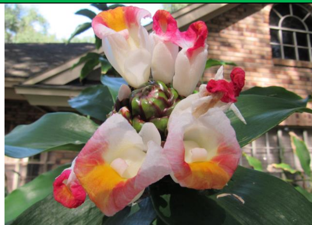
9/5/20 Plant Picture of the Day: Costus lucanusianus 'Cameroon Queen'